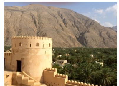
Nakhla Fort, Oman.

See the trip flyer/reservation form on the SAA website for details.