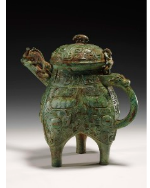
Bronze vessel from Zeng tomb no. 28 at Yejiashan, Suizhou, ca. 1000 BCE.