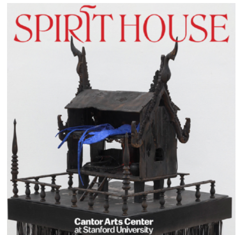
Korakrit Arunanondchai (b. 1986, Bangkok, Thailand; lives and works in Bangkok and Brooklyn, NY), Shore of Security , 2022. Repurposed wooden doll house made by the artist's mother, wood, house paint, polyurethane, fabric sculpture, ceramics, snake skeleton, LED lights. 60 in. x 29 ¼ in. x 29 ¼ in. (152.4 cm x 74.3 cm x 74.3 cm). Courtesy of the artist and C L E A R I N G, New York / Brussels / Los Angeles. Photo: JSP Art Photography. Photo courtesy of Cantor Arts Center.

Following the tour, you may opt to view more art or have lunch in the museum's café.