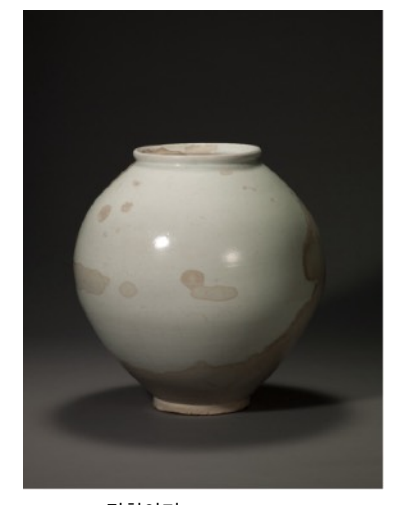
Moon Jar 달향아리, 1700s, Joseon dynasty (1392–1897). Porcelain with clear glaze 17 ½ x 16 % in. Private collection. National Treasure of Korea (2007-1).