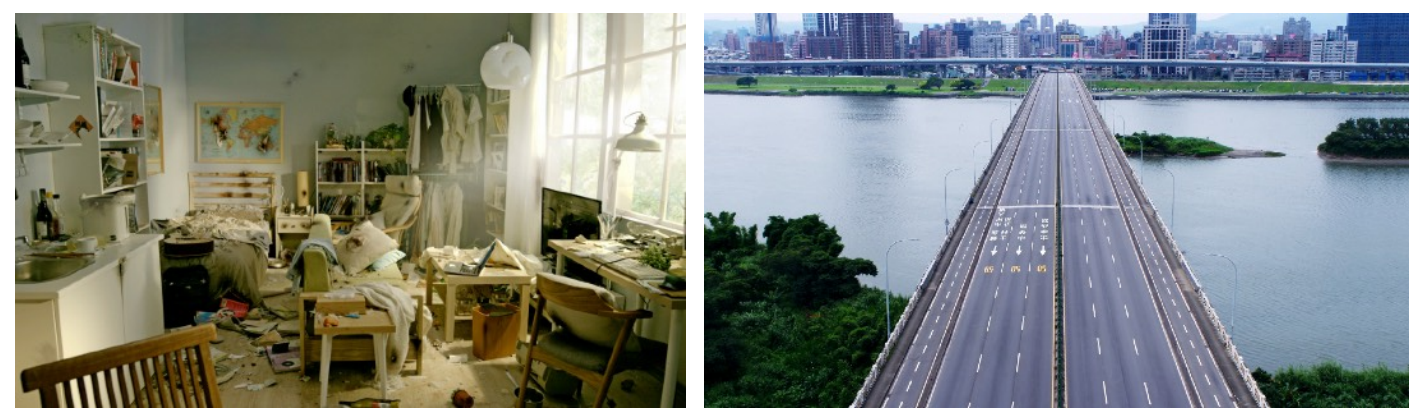
Left: Everyday War, 2024, by Yuan Goang-Ming (b. Taipei, 1965). Single-channel video with sound; 10:33 min. © Yuan Goang-Ming. Courtesy of the artist. Right: Everyday Maneuver, 2018, by Yuan Goang-Ming (b. Taipei, 1965). Single-channel video with sound; 5:57 min. © Yuan Goang-Ming. Courtesy of the artist.

Don't miss this critically acclaimed exhibition in the Akiko Yamazaki and Jerry Yang Pavilion, the artist's first North American solo show. The exhibition is curated by Abby Chen, Curator of Contemporary Art at the Asian Art Museum and features many works that debuted in Yuan's celebrated 60th Venice Beinnale 2024 presentation.