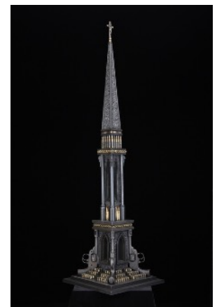
Sculpture by Al Farrow