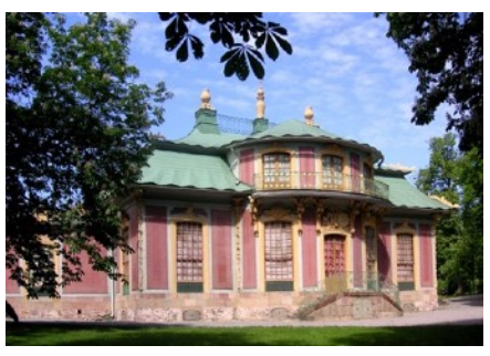
Chinese Pavilion at Drottningholm Palace

Scandinavia – often associated with Viking legends and modern design – seems an improbable destination for great collections of Asian art. Yet countless Swedish and Danish archaeologists, missionaries, diplomats, and private individuals have donated objects to collections in Stockholm, Gothenburg, and Copenhagen. Expect an eyeopening, edifying, and entertaining experience! Highlights include visits to Stockholm's Museum of Far Eastern Antiquities and the Museum of Ethnography, Gothenburg's Rőhsskamuseet, and Copenhagen's The David Collection and the National Museum of Denmark. This trip kicks off with an entertaining weekend in Visby, on the island of Gotland, where we will partake in the largest medieval festival in Europe.