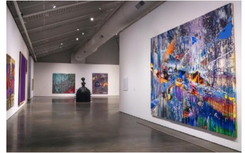
Installation view of Making Their Mark: Works from the Shah Garg Collection .

After the gallery visit, we will have a no-host lunch at a nearby restaurant.