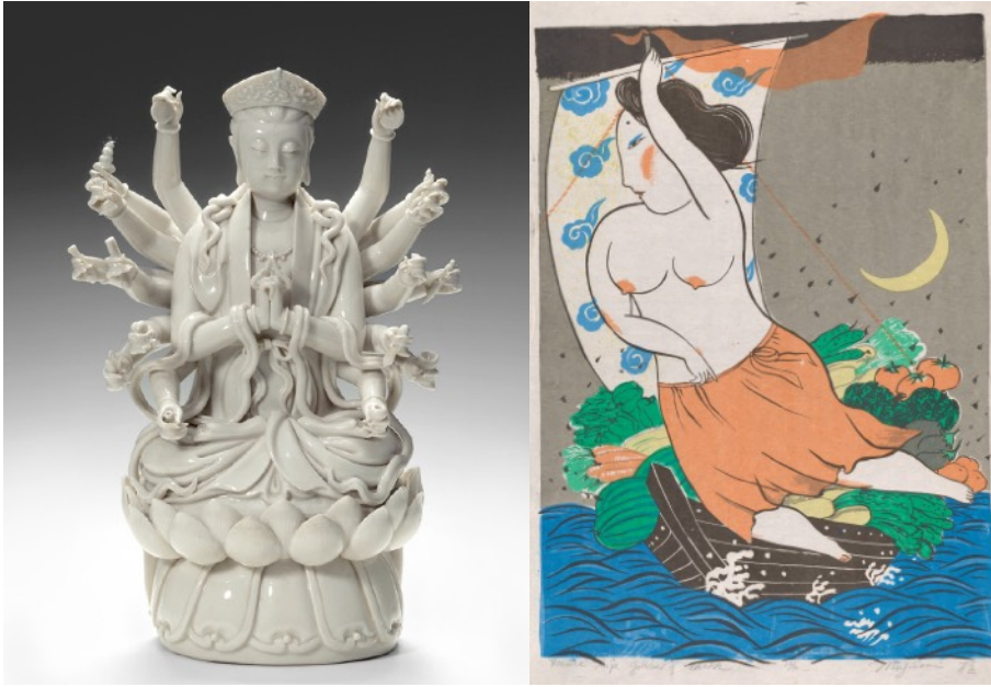
Left: The Daoist deity Doumu, approx. 1700–1800. China; Fujian province. Qing dynasty (1644–1911). Porcelain, mold-impressed, with sculpted decoration. Asian Art Museum of San Francisco, The Avery Brundage Collection, B6OP1362.