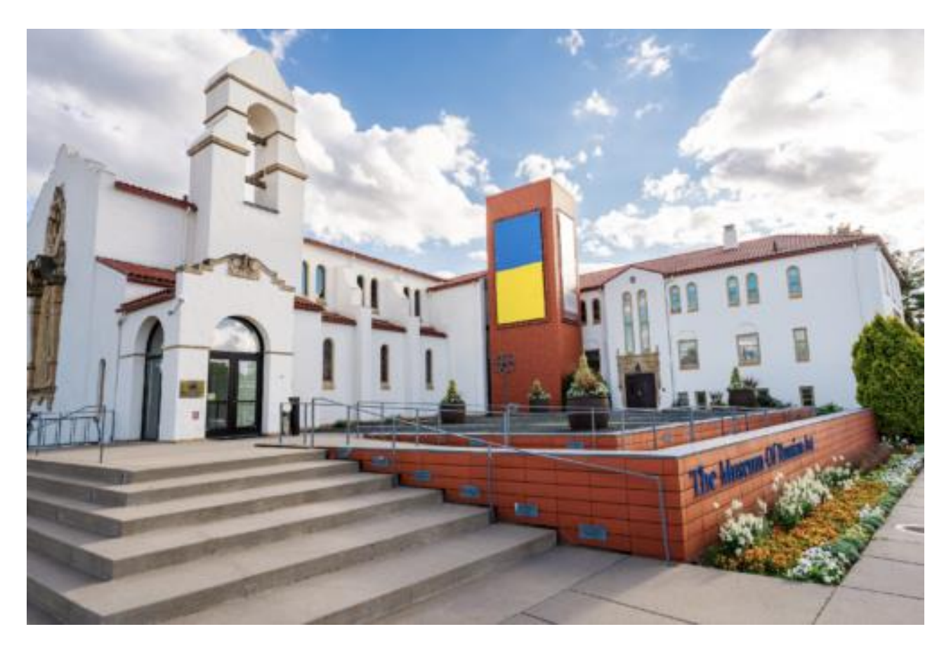
The Museum of Russian Art, housed in a former church since 2005