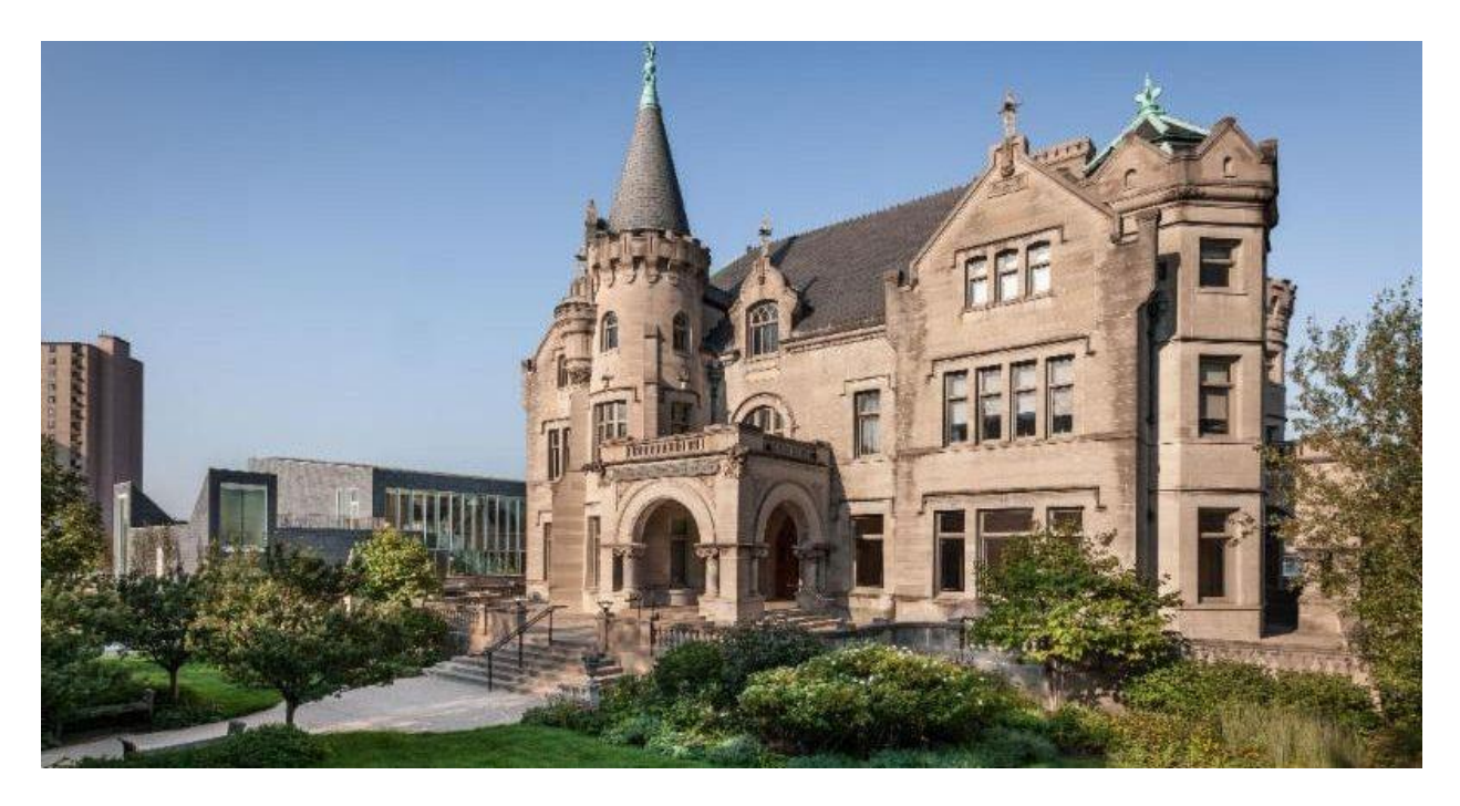
The Swan Turnblad Mansion (1903-10) now housing the American Swedish Institute, was added to in 2012 for expanded gallery space, reception area, shop and café.