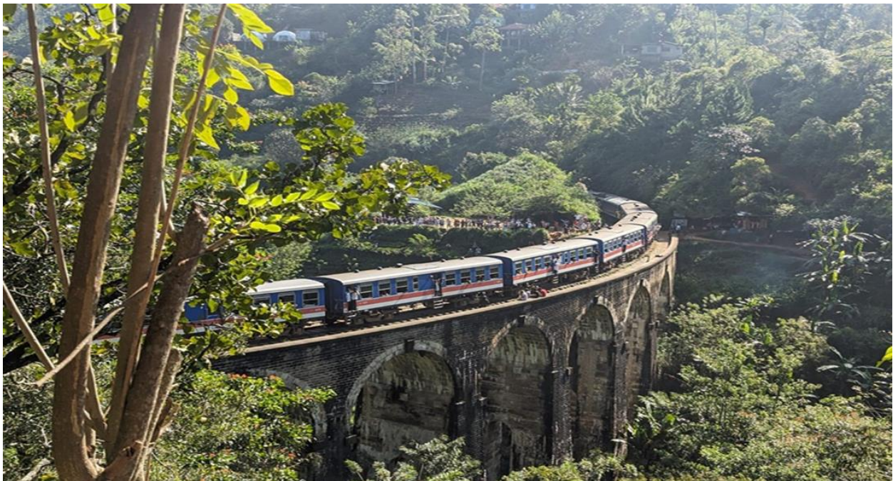
Train rides to mountains and Tea Estates,