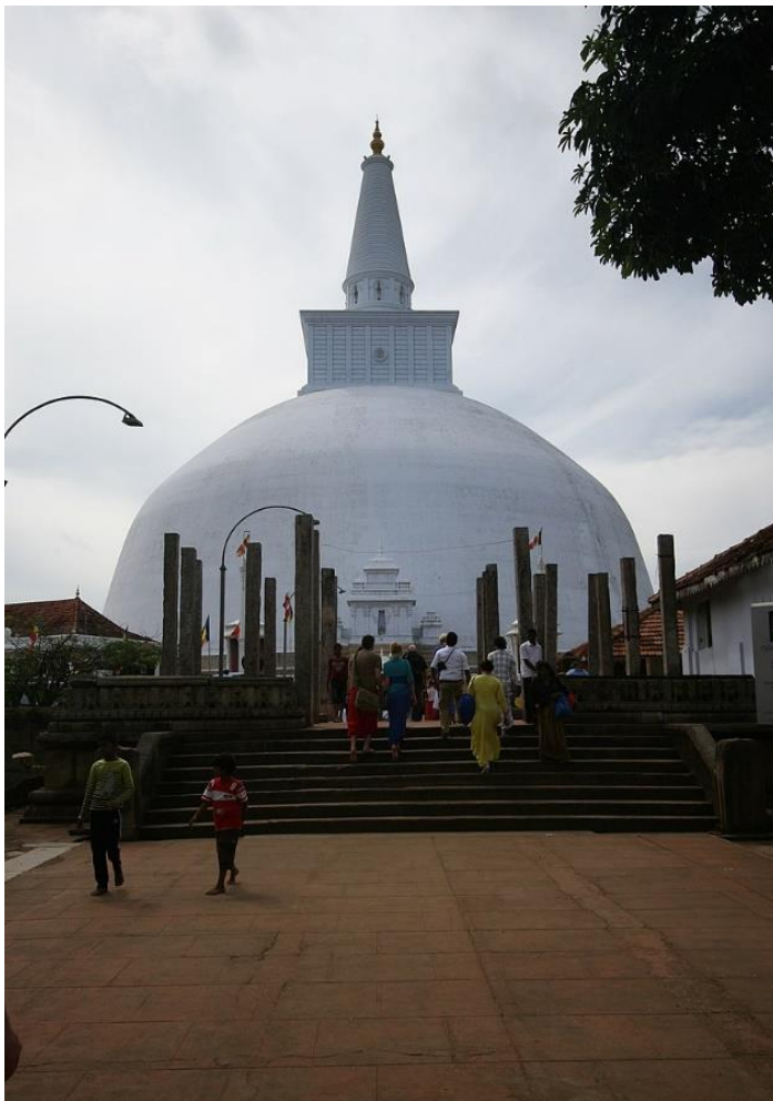
Ruwanwelisaya Stupa, 140 BCE, Anuradhapura

RESERVE VIA LINK TO ONLINE RESERVATION FORM