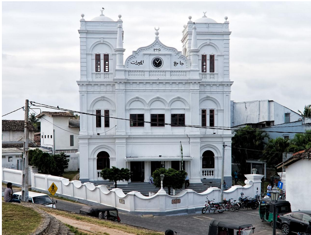
Meeran Mosque, 1904, built to the style of Portuguese Baroque cathedral, - Galle