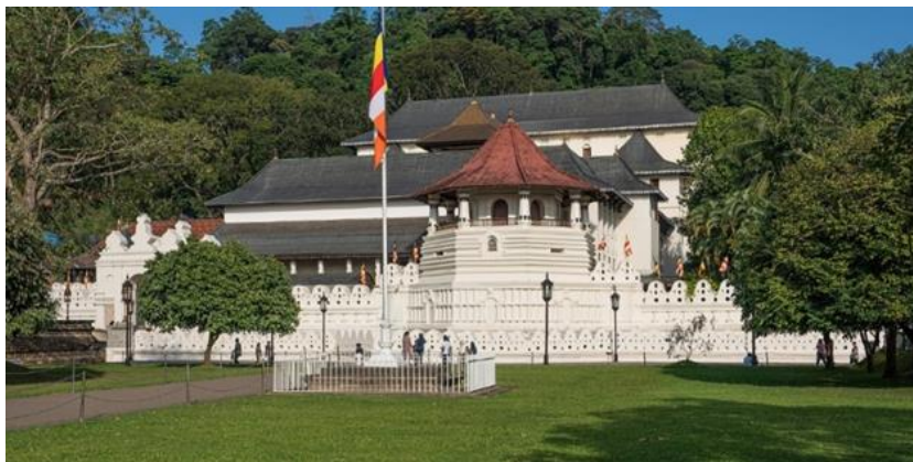
Sri Dalada Maligawa - Temple of the Tooth, Kandy